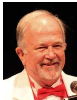
GOVERNOR DAVE STOCKUM

Best wishes for a great September as school with all its activities resume.