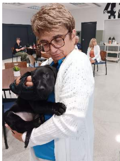
OH2 Governor, Becky Thornton holding an 8 week old puppy. The pup was so cuddly and cute!