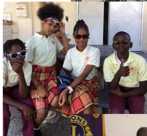
Students displaying new sunglasses at VOSH clinic