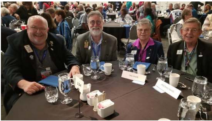
Good food, good people, good sessions and programs! Shuttle service-not so good.