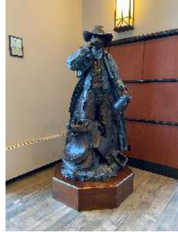
And so does he...