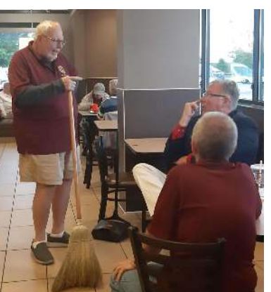
The North Baltimore Lions Club recently sponsored a fundraiser at the North Baltimore McDonalds.