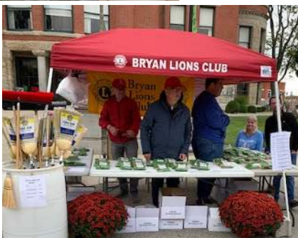
Bryan Lions Club at Bryan Fall Fest on the square selling our Terri Lynn nuts & chocolates and Lions Brooms

Bryan Lions collected Food and Personal Hygiene items to be donated to the Bryan Area Outreach Center. THANKS to all that donated. We SERVE