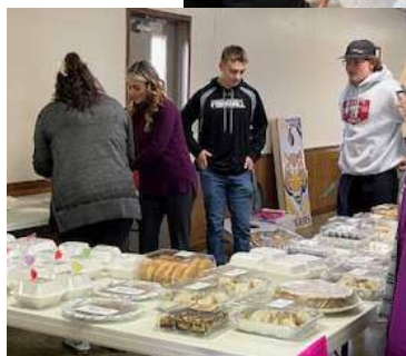
So many goodies